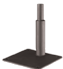
Model: 960-06 Mount Stand, 6" (127mm)