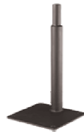
Model: 960-09 Mount Stand, 9" (203.2mm)

Click on any of the above images to find out more about the products pictured.