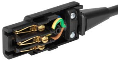
Example with assembled cable