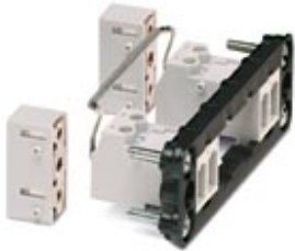
Panel mounting frame, with capacitive PE, for contact insert modules, type 3, number of insert modules 4

Please be informed that the data shown in this PDF Document is generated from our Online Catalog. Please find the complete data in the user's documentation. Our General Terms of Use for Downloads are valid ( http://phoenixcontact.com/download )